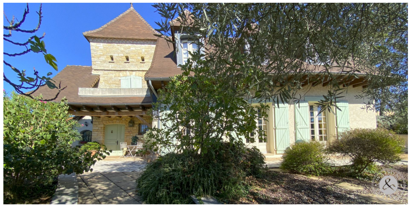
Ref : 9824CHG