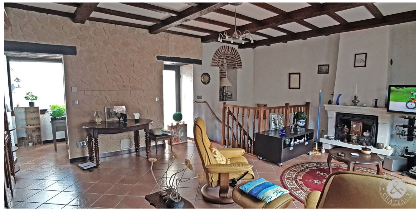
Ref : 9677LRC